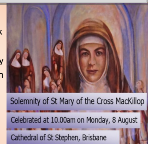
Solemnity of St Mary of the Cross MacKillop