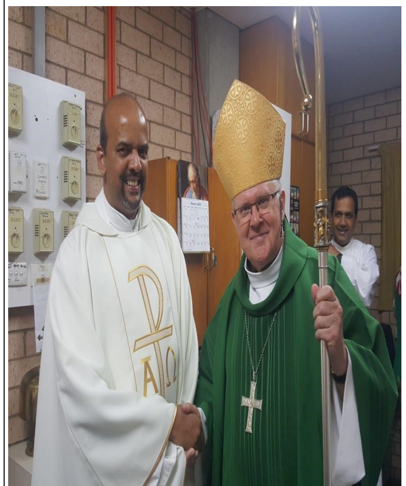
From the Installation Mass with Archbishop